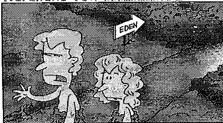
OUR RESOLUTION LAST YEAR COULD HAVE BEEN "LESS FRUIT" BUT NO ... WE WENT WITH "TRUST SNAKES MORE"